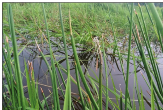
Figure 1: Chinese water chestnut ( Eleocharis dulcis )

The results of Anisah et al. , [13] analysis of chemical components with gas chromatography-mass spectrometry showed that the most active extracts of ethanol extract on Jabon leaves contained phenolic compounds (quinic acid, catechol) and fatty acid derivatives (hexadecanoic acid) which had potential antidiabetic activity. Quinic acid phenolic compounds have antidiabetic activity in