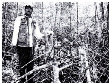
Figure. 3. Illegal logging of mangrove forest at Pulau Ruku, INHIL.