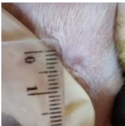
Figure 2. Wound healing in spray gel treatment

healing and significantly ( p < 0.05 ) considerable wound healing if than negative control. Table III also showed that placebo significant differences exist among positive control. This show that placebo of spray gel does not accelerate to wound healing process. Then, extract, F1, F2, and F3 no significant differences than positive control.