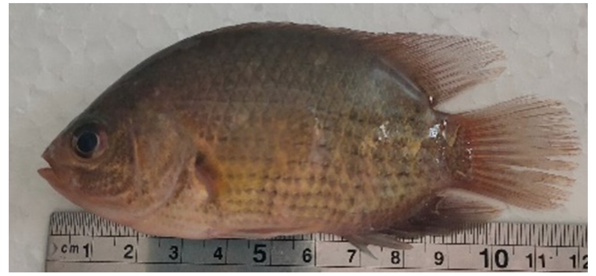
Figure 1. Indonesian leaffish (Pristolepis grooti).