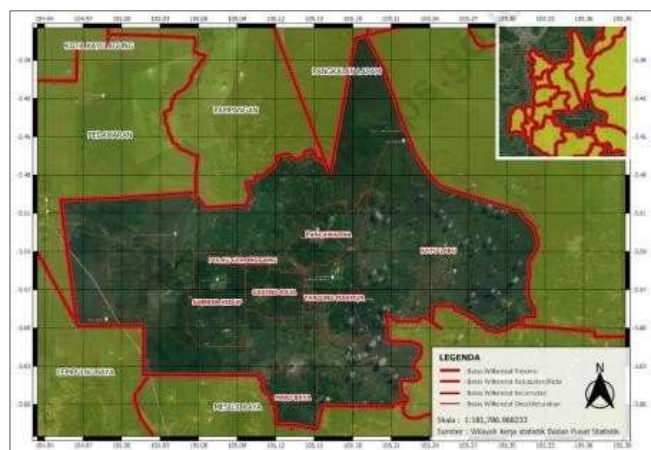
Fig 1: Map of the study site for the length-weight relationship and condition factor of Notopterus notopterus (Pallas, 1769) from East Pedamaran Sub-district, Ogan Komering Ilir Regency, South Sumatra, Indonesia

A total of 108 N. notopterus were collected from local fishermen at the study site. Traditional fishing gear (gill nets, hand lines, bamboo traps, and fish barriers) was found to be used by fishermen to catch the fish. The fish samples were transported to the UPR Batanghari Sembilan Indralaya, and preserved in 10% formalin until the measurement was taken. In the laboratory, the total length (TL) and body weight (BW) of each specimen were measured to 0.1 cm and 0.1 g accuracy with calipers and an electronic balance, respectively.