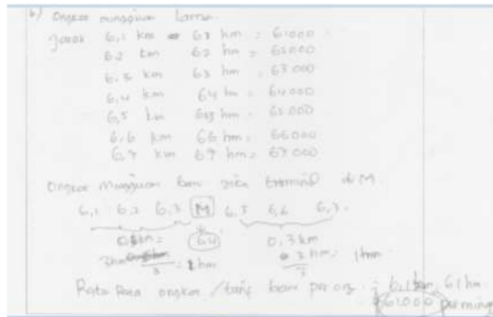
Figure 3. Subject's answer for number 2.

Figure 3 shows the subject's answer for number 2. Subject use the strategy to determine the price of transportation to be paid.