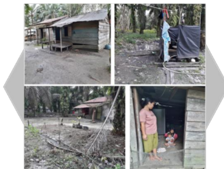
Figure 2. SAD Environmental Conditions in Nyogan Village

Inadequate household environment is the cause of the high incidence of stunting in SAD toddlers. A good enough household environment determines whether or not the innate potential of toddlers can be achieved. For example, nutritional problems in Nyogan village are caused by environmental factors such as inadequate sources of drinking water, sanitation and sanitation facilities, which can be seen in table 5 and figure 2.