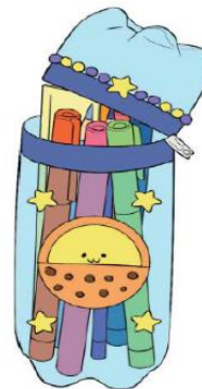
Figure 4. The representation of creativity and innovation

This task promotes creativity and innovation abilities among students by inspiring them to repurpose a discarded item into a practical object. The specific example given is a pencil case crafted from a repurposed plastic bottle, which requires problem-solving, critical thinking, imagination, and adaptability to achieve the desired outcome. Additionally, This assignment cultivates environmental awareness by prompting students to recycle and repurpose materials, thereby fostering ecological literacy. While being mindful of the environment. The instructions use various communication strategies, such as imperative statements to communicate a sense of immediacy and command, second-person pronouns to imply personal responsibility and agency, and a visual depiction to complement the verbal project description. The inclusion of the term "Do-It-Yourself" indicates that the project entails active involvement and exploration, rather than mere observation, fostering a sense of collaboration and collective engagement.