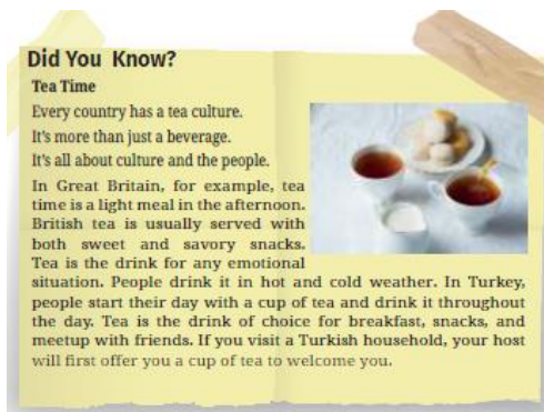
Figure 5. The representatin of information literacy

The text offers insights into the tea culture of various countries and develops students' abilities to access, evaluate, and apply information. It details various tea-drinking customs, such as British tea served with snacks and Turkish tea consumed during breakfast and social gatherings. The information serves as a valuable resource for those interested in tea culture worldwide, helping readers to manage information flow from various sources while understanding the legal and ethical aspects of information usage. The picture complements the text, portraying tea as an essential element of culture and social life. The multimodal representation creates a comprehensive overview of tea culture in different countries, making the content more engaging and memorable for the audience.