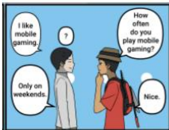
Figure 8. The integration of initiative and self-direction

The textbook has 26 self-directed learning activities that help students set goals, manage their time, and reflect on their progress. These activities aim to promote autonomy and accountability, which are crucial for academic and personal achievement.