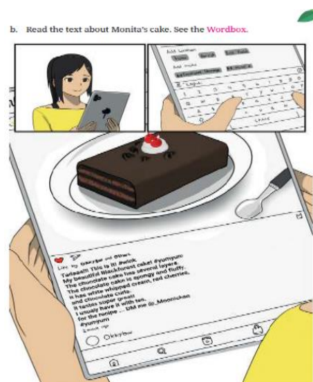
Figure 6. The representation of ICT literacy

The textbook includes 42 tasks to improve students' ICT literacy skills, which involves using digital tools for research, organization, evaluation, and communication, while considering ethical and legal considerations (Rakhmawati & Priyana, 2019).