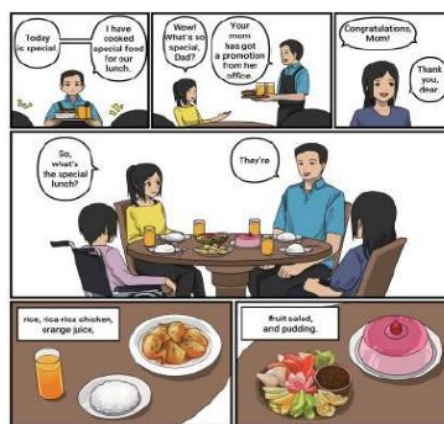
Figure 13. The presentation of economic literacy

The textbook discusses economic literacy and the skills students need to make informed decisions. It includes personal economic choices, the economy's role in society, and entrepreneurial skills (Wibowo et al., 2023). However, there is only a task in the textbook, raising concerns about the lack of integration of economic literacy skills into educational resources.