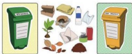
Figure 16. The presentation of environmental literacy

Proficiency in identifying and categorizing waste materials into suitable groups is a vital environmental competency that contributes to maintaining a healthy and sustainable environment. The picture and instruction in this text use language and visual elements to convey information about waste separation. The image features green and yellow waste bins and objects representing different types of waste. The colors of the bins symbolize nature and cleanliness, respectively. The directive prompts the students to segregate the items in the image according to their organic and non-organic classifications. Through this multimodal social semiotic system, students can comprehend and adhere to the instructions efficiently, facilitating effective waste management. This competency aids in minimizing landfill waste and environmental pollution, thereby enhancing overall environmental health.