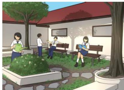
Figure 2. The representation of communication

b. Write sentences for the following place. Use the words to help you. The words can be used in some sentences. You can also use your own words