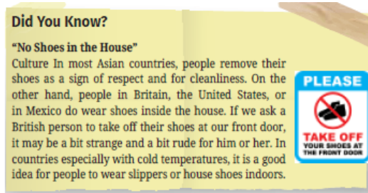
Figure 9. The integration of social and cross-cultural interaction

The textbook offers 17 tasks to foster social and cross-cultural skills, which are essential for effective communication and respect for diverse cultural backgrounds.