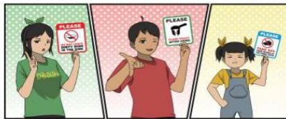
Picture 3.8 Sticker sign