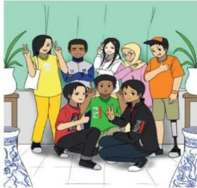
Figure 1. The representation of critical thinking and problem solving

a. Look at Picture 1.3. Observe the physical traits of each person in the picture. You can use the words in the box to describe each person. See the Wordbox.