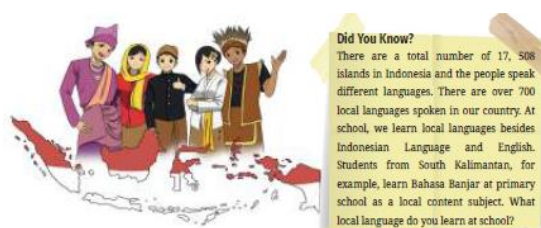
Figure 14. The integration of civic literacy

Civic literacy skills encompass the competencies necessary for students to effectively engage in civic life. They require knowledge, skills, and attitudes to remain informed, participate in democratic processes, and comprehend the repercussions of civic choices. Through these capabilities, students emerge as proactive and involved citizens capable of effecting positive change in their communities and beyond. Unfortunately, this textbook only includes 4 tasks that integrate civic literacy skills.