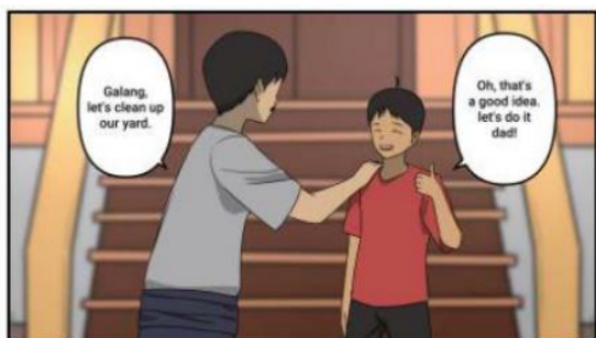
Figure 11. The presentation of leadership and responsibility

The textbook has a section on the 21 st century skill of leadership and responsibility. This involves guiding and motivating others to complete tasks, acting with integrity and ethical behavior, and taking responsibility in the community (Sulam et al., 2019). There are 4 tasks in the textbook that demonstrate how to integrate leadership and responsibility.