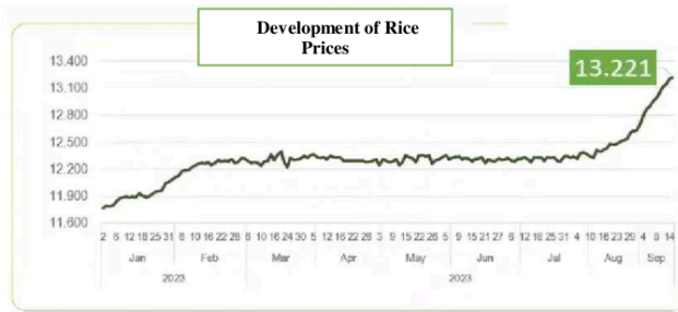
Figure 2. Rice price development