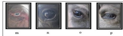
Figure 5. Variations of the shape and color of the eyes of the swamp buffalo : (a) red, (b) black, (c) mottle, (d) Lampung (Windusari et al. , 2016)

Horn determined morphological differences of 31 morphological characters were observed covering the base of the horn shape, ear shape, accessories on the