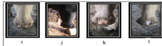
Figure 3. Nose shape variations of the swamp buffalo: (a) red, (b) black, (c) mottle, (d) Lampung (Windusari et al. , 2016)