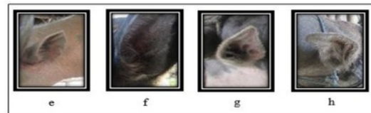
Figure 4. Ears shape variations of the swamp buffalo : (a) red, (b) black, (c) mottle, (d) Lampung (Windusari et al. , 2016)