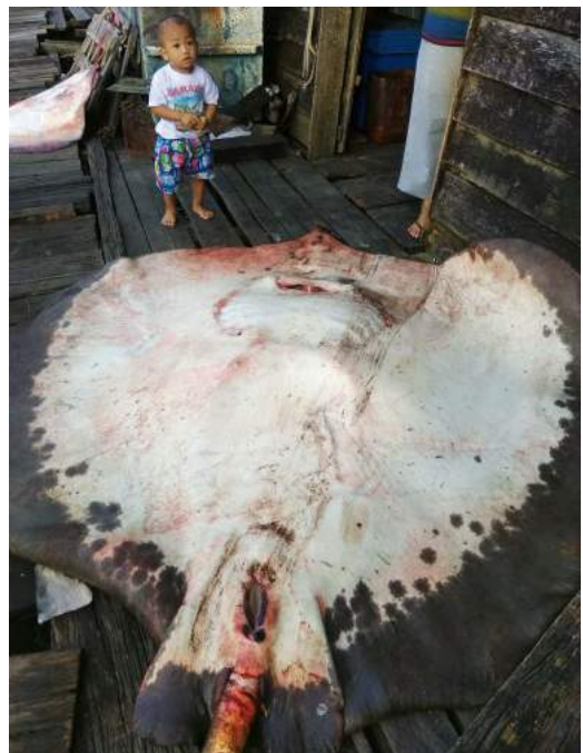
Fig. 4. Urogymnus cf. polylepis caught by local fishermen on 12 April 2018 in Tarakan, Pulau Tarakan, Kalimantan Utara, Indonesia (photograph by Rika Arif).

A record of Urogymnus cf. polylepis from Danau, Kampung Penapar, Telisai coastal village, Tutong district, on 20 September 2011 represents the country's first confirmed record for Brunei Darussalam.