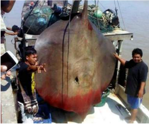
Fig. 2. Urogymnus cf. polylepis caught by local fishermen on 25 August 2013 in Beluran, Sandakan, Sabah, Malaysian Borneo.