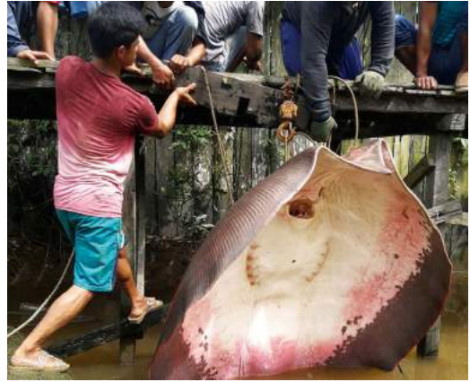
Fig. 3. Urogymnus cf. polylepis caught by local fishermen on 7 January 2018 in Handil, Kutai Kartanegara, Kalimantan Timur, Indonesia.

Hilir Selatan, Kalimantan Tengah, Indonesia) in the southern part of the island (Table 1). Records of individual weights ranged from 82 to 400 kg. Unfortunately, information on total length and disc width are very limited, as in most instances measurements were not taken by fishermen, and fishermen frequently remove the tails of these rays to avoid the caudal sting. Urogymnus cf. polylepis reaches at least 2 m disc width and 5 m in total length, and can possibly grow larger according to reports from the Mekong and Chao Phraya Rivers of individuals weighing 500–600 kg (Monkolprasit & Roberts, 1990; Last et al., 2016a).