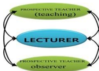
Figure 1. Peer Coaching Approach