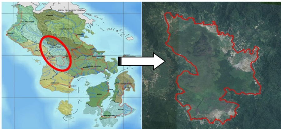
Figure 1. Tinondo Swamps Irrigation Area

The research location is located in Rawa Tinondo Irrigation Area, East Kolaka Regency, Southeast Sulawesi Province with total area of 3,123.4 Ha. The geographical location of the research location is located in the western part of Southeast Sulawesi Province, Indonesia The research location is located in 2 (two) districts. Tinondo sub-district and Lalolae sub-district covering 6 residential areas (Transmigration) namely: Tinondo Village, Lamunde Village, Lalosingi