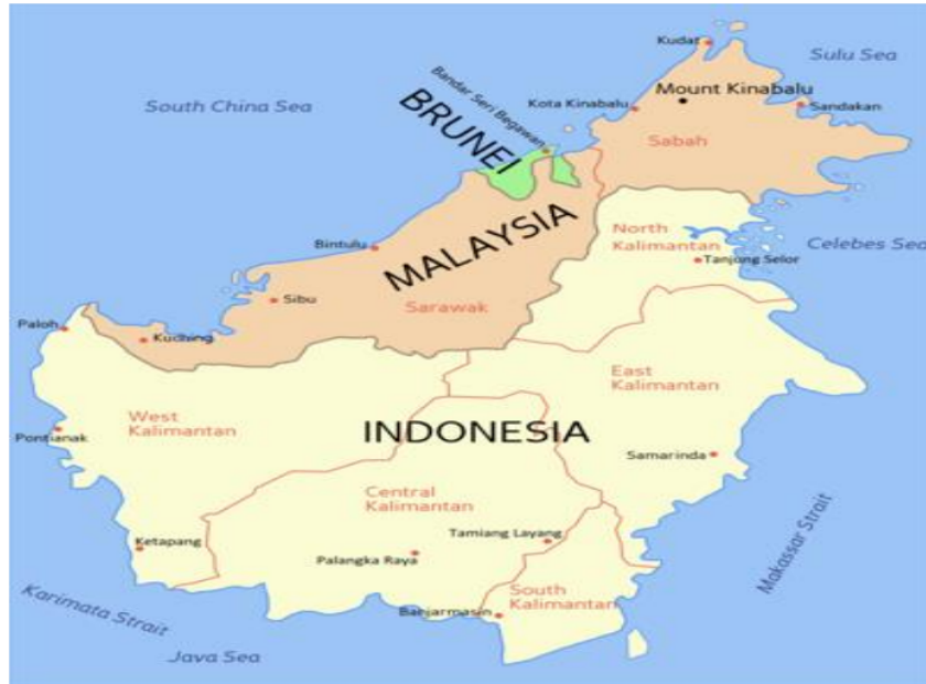
Figure 1. Map of the administrative of Borneo

Between 1994 and 2004, at least 361 new species have been described from Borneo, which are, 260 insects, 50 plants, 30 freshwater fishes, 7 frogs, 6 lizards, 5 crabs, 2 snake, and a toad. v