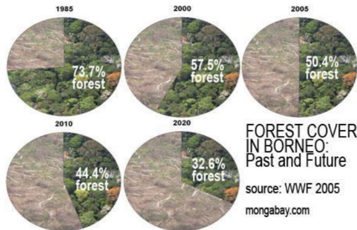
Figure 2. The rate of deforestation in Borneo