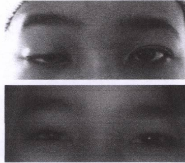
Fig 1. Top: Preoperative photograph of first patient. Bottom: Postoperative photograph of second patient with fair result.

Patients had no complain drooping in the upper eyelid RE and difficulty of reading anymore. After performed frontalis suspension surgery, patients had lagophthalmos. But throughout follow up period of 6 months, lagophthalmos were resolved for both patients.