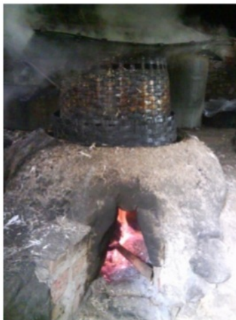
Figure 2. Sugar-cane stove made of stone equipped with "Beetle Hole" in Sungaipuar, Agam, West Sumatera