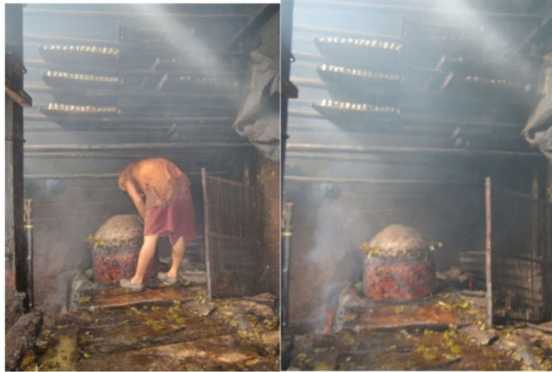
Figure 3. a). Hot Flue Gas Escapes in Working Area in the Hut Used to Dry the Wet Mold Gambir Placed on Trays Made of Bamboo Above Local Stove, b). The Worker Could Suffer Breathless or Burn by Spark of Fire from Dirty Hot Flue Gas