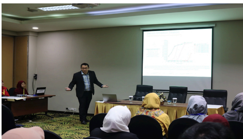
Picture 4. One of the invited speaker's talk.