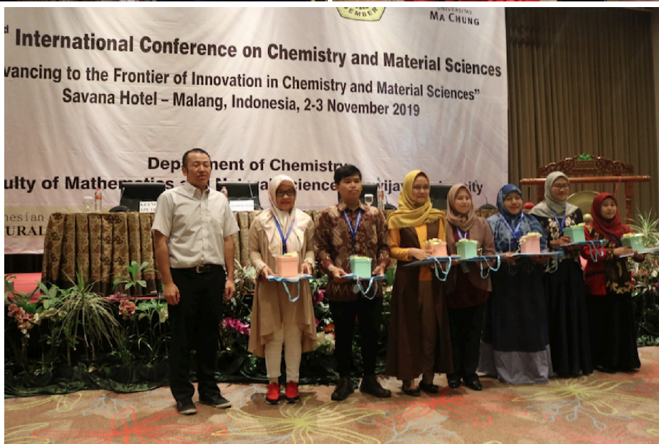
Picture 3. Poster session and poster award winners.