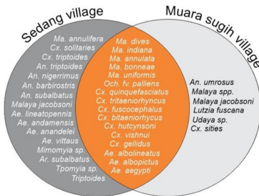
Figure 3. Species composition of mosquitoes at study areas of two villages in Banyuasin District, South Sumatra, Indonesia

Interestingly, there is an opposite pattern of dominant genus between two study areas in which a dominant genus in a village has a low number and percentage in the other village and vice versa. For example, there were 3.14% of Mansonia detected in Muara Sugih, while Culex comprised 3.09% of total mosquitoes in Sedang Village. Other species have medium level of occurrence in both studied areas such as Aedes , but it has higher number collected in Muara Sugih Village than in Sedang Village. The rest genera relatively have similar numbers for both studied-areas. The findings of the diversity from two different studied areas provide baseline information on the distribution of mosquitoes in Banyuasin District.