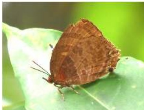
Figure 1. An individual of Flos apidanus phalakron found on 17 March 2020 at campus Sriwijaya University in Indralaya, South Sumatra.

There are two subspecies of Flos apidanus in Sumatra, Flos apidanus phalakron (Fruhstorfer, 1914) and Flos apidanus saturatus (Snellen, 1890). The Flos apidanus phalakron is distributed from Weh Island (Aceh) to Palembang (South Sumatra), and Flos apidanus saturatus distributed in Riau archipelagos to Bangka Belitung islands (Snellen, 1890; Fruhstorfer, 1914; Toxopeus, 1929; d'Abrera, 1986).