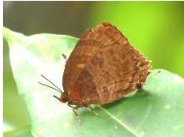
Figure 1. An individual of Flos apidanus phalakron found on 17 March 2020 at campus Sriwijaya University in Indralaya, South Sumatra.

There are two subspecies of Flos apidanus in Sumatra, Flos apidanus phalakron (Fruhstorfer, 1914) and Flos apidanus saturatus (Snellen, 1890). The Flos apidanus phalakron is distributed from Weh Island (Aceh) to Palembang (South Sumatra), and Flos apidanus saturatus distributed in Riau archipelagos to Bangka Belitung islands (Snellen, 1890; Fruhstorfer, 1914; Toxopeus, 1929; d'Abrera, 1986).