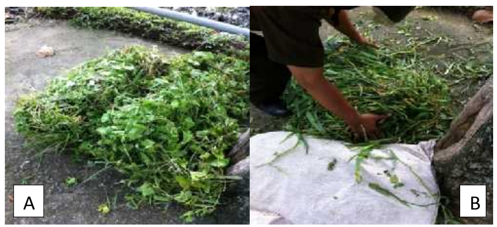
Figure 2 . Asystasia sp (A), Paspalum conjugatum (B)

According to field observation, the foods given in captive deer PT. Pusri Palembang divided into two types, such as forage and additional food. The forage is from rumputpaitan(Paspalumconjugatum) and bayam-bayaman (Asystasiasp). Both of these forages are given as much as 50 kg, and given two times a day, at 08.00 am and 03.00 pm.Furthermore, tubers are an additional food which given as much as \pm 1.5 kg twice a day. It is required to cutthe tubers into small size to make it easier for the deer to consume. Forages were given in captivity is not enough for 44 deer. In accordance with related research of (Sutrisno, 1996 in Kartono et al. 2008) which states that a sambar deer needs as much as 5.823 kg/each/day of fresh foods or 11.64 kg/2species/day. In accordance with this research, captive deer PT. Pusri with a total of 100 kg of foods for each day (twice per day) are not enough for 44 deer. More than 200 kg per day should be added to fulfill the foods for all of the deer.