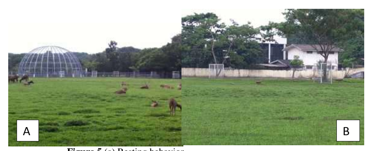
Figure 5. (a) Resting behavior (b) Captivity area with good condition