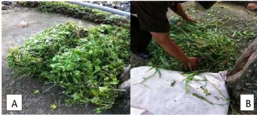
Figure 2. Asystasia sp (A), Paspalum conjugatum (B)

According to field observation, the foods given in captive deer PT. Pusri Palembang divided into two types, such as forage and additional food. The forage is from rumputpaitan(Paspalumconjugatum) and bayam-bayaman (Asystasiasp). Both of these forages are given as much as 50 kg, and given two times a day, at 08.00 am and 03.00 pm. Furthermore, tubers are an additional food which given as much as \pm 1.5 kg twice a day. It is required to cutthe tubers into small size to make it easier for the deer to consume. Forages were given in captivity is not enough for 44 deer. In accordance with related research of (Sutrisno, 1996 in Kartonoet al. 2008) which states that a sambar deer needs as much as 5.823 kg/each/day of fresh foods or 11.64 kg/2species/day. In accordance with this research, captive deer PT. Pusri with a total of 100 kg of foods for each day (twice per day) are not enough for 44 deer. More than 200 kg per day should be added to fulfill the foods for all of the deer.