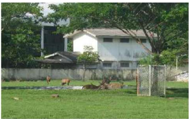
Figure 1. Water pool in captive deer PT. Pusri Palembang

The waterpool in the captivity is quite enough to fulfill the water consumption of deers. But the waterpool sometimes used by the deers to wallow than using it to drink. To optimize the waterpool as a water source, it is better if the pool is not use as a wallow place, so the deer condition will always good. The other pool need to be built so it can be used as wallow place rather than drinking it directly from the waterpool. This is supported by the opinion of Semiadi and Nugraha (2004) which states a waterpool that serves as drinking water, upper place can be covered with wire so the deer will nottry to get into the pool but only its snout can get in to drink.