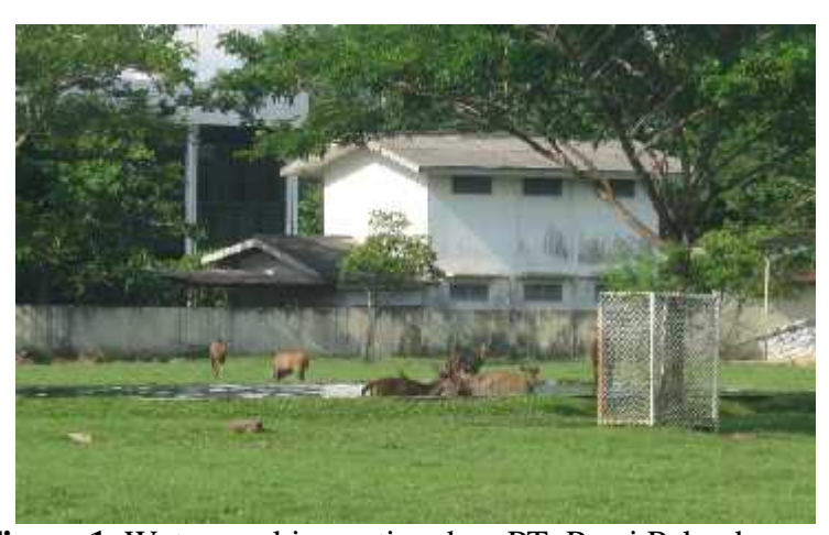
Figure 1. Water pool in captive deer PT. Pusri Palembang

The waterpool in the captivity is quite enough to fulfill the water consumption of deers. But the waterpool sometimes used by the deers to wallow than using it to drink. To optimize the waterpool as a water source, it is better if the pool is not use as a wallow place, so the deer condition will always good. The other pool need to be built so it can be used as wallow place rather than drinking it directly from the waterpool. This is supported by the opinion of Semiadi and Nugraha (2004) which states a waterpool that serves as drinking water, upper place can be covered with wire so the deer will nottry to get into the pool but only its snout can get in to drink.