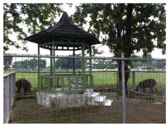
Figure 3. A place for giving the food to the deers