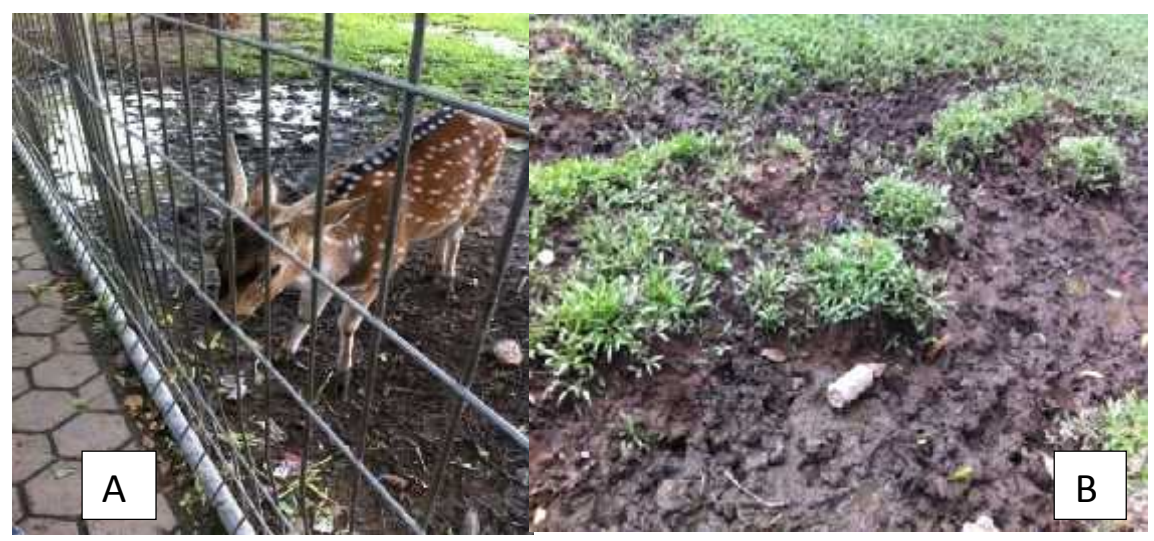
Figure 4. Muddy area which is often used by the deers

Based on the observations that has been done, the grasses which planted in the catchment area grows beautifully in the middle of captivity. However, this condition is very different from the area around the fence near the trees where that space often used by the deer as a resting place from the heat and that space is often used by visitors to give a food for the deer, although its already mentions on the board that visitors do not allowed to give their food for the deer. The grass in this area is no longer exists and the soil becomes muddy.