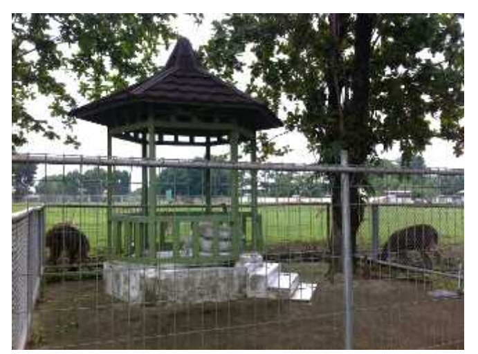
Figure 3 . A place for giving the food to the deers