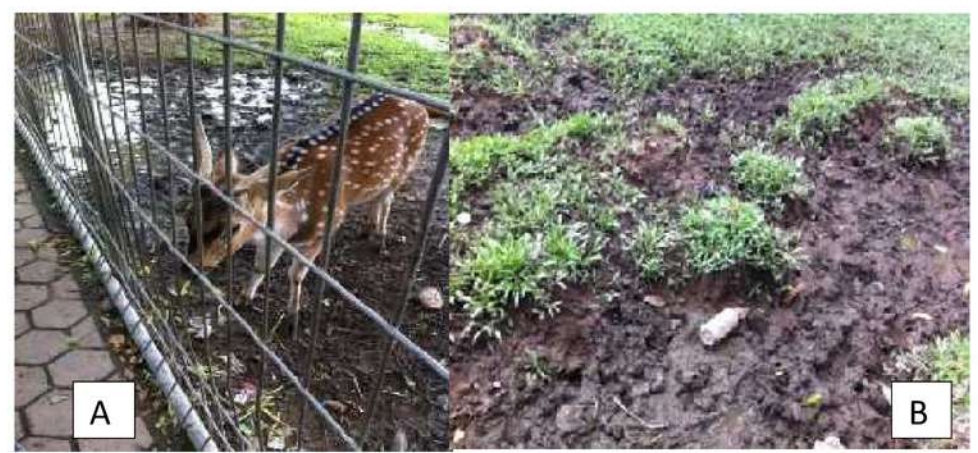
Figure 4. Muddy area which is often used by the deers

Based on the observations that has been done, the grasses which planted in the catchment area grows beautifully in the middle of captivity. However, this condition is very different from the area around the fence near the trees where that space often used by the deer as a resting place from the heat and that space is often used by visitors to give a food for the deer, although its already mentions on the board that visitors do not allowed to give their food for the deer. The grass in this area is no longer exists and the soil becomes muddy.