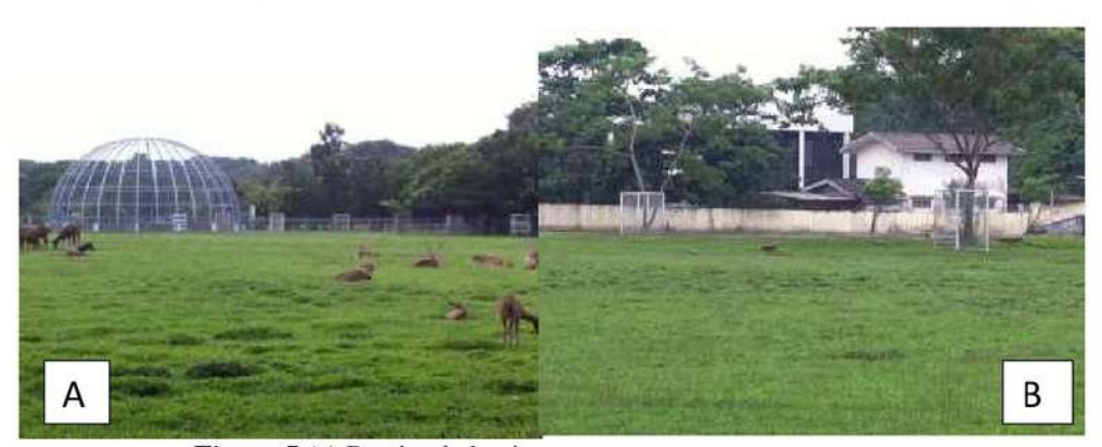
Figure 5.(a) Resting behavior (b) Captivity area with good condition