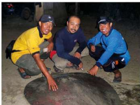
Fig. 2. Urogymnus cf. polylepis caught by local fishermen on 11 Jun 2012 in Tanjung Pahang, Kuantan, Malaysia.