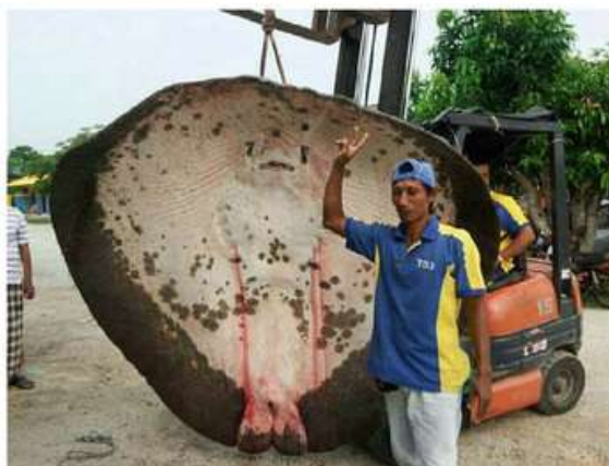
Fig. 3. Urogymnus cf. polylepis caught by local fishermen on 23 July 2013 in Klang, Selangor, Malay Peninsula.

of dorsal surface of disc uniformly brownish or greyish brown (Fig. 2), and ventral surface with a broad black marginal band around the disk (Fig. 3) [Monkolprasit & Roberts, 1990; Iqbal & Yustian, 2016; Last et al., 2016a; Windusari et al., 2018]. Details of sites, coordinates, dates and other remarks are provided in Figure 1 and Table 1.