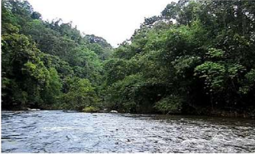
Figure 1. Muara Kulam River of Musi basin, location where L. ixocheilos found in South Sumatra province.

carried out on 19–22 April 2016 in the Muara Kulam River (02°48'10.6" S, 102°21'11.2" E), a tributary of the Lematang drainage in the Musi basin. This river is surrounded by secondary dipterocarp forest with little encroachment and a low intensity of selective illegal logging by local people (Fig. 1). Administratively, the site is located in Muara Kulam village, Rawas Ulu subdistrict, Musi Rawas district, South Sumatra province. The topography is hilly forested at 508 m above sea level. This area is under the management of subsection V or SPTN V (SPTN = Seksi Pengelolaan Taman Nasional Wilayah, or or Regional Park Management Section) of Kerinci Seblat National Park (Anonymous 2016). Due to the area being part of a national park, collection of specimens is prohibited, unless special permits are obtained. Unfortunately, as we did not have a permit for collecting specimens during our fieldwork, no voucher specimens were retained.