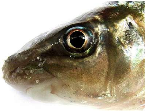
Figure 3. Close view of head of Lobocheilos ixocheilos showing the mouth pattern (Photograph by M. Iqbal).