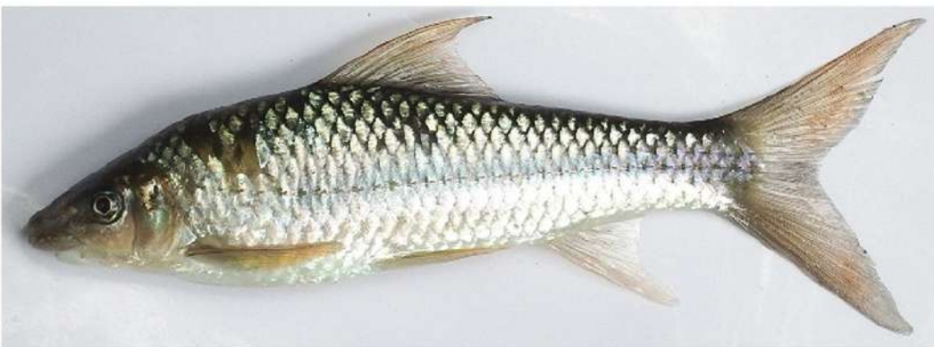
Figure 2. Specimen of Lobocheilos ixocheilos caught on 19 April 2016 from the Musi basin, Muara Kulam River, South Sumatra (Photograph by M. Iqbal).

The distance between Muara Kulam River of Musi basin with previous localities where L. ixocheilos previously found in Sumatra is about 150 and 250 km. Major studies of cyprinid faunas in Southeast Asia have occasionally been confined to single drainage basins (Rainboth 2001). For the example, in Sumatra, a fish fauna survey in Batang Hari basin conducted by Tan and Kottelat (2008) has given better understanding on cyprinid fish diversity in this area, compare to other basins in the island. For a