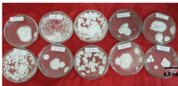
Figure 1. Beauveria bassiana SDA culture incubated for 7 days.