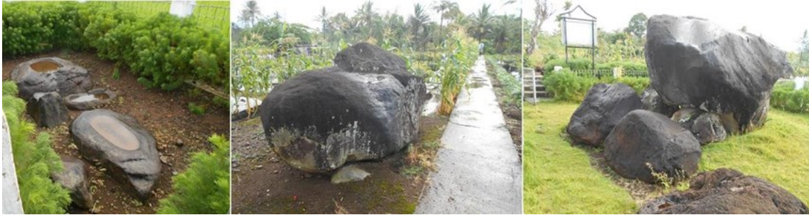
Figure 7. Megalithic site in Gunung Kaya village, Jarai district

ing, waterfalls ( cughup ), and coffee plantations.