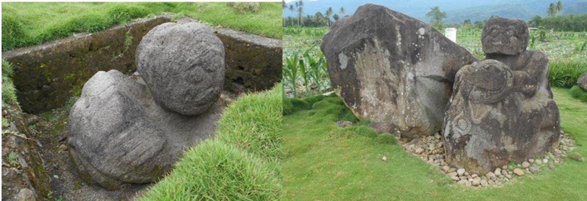
Figure 2. Unique Megalithic site in Gunung Megang village, Jarai district which can be used as a tourist attraction

Almost all assume that megalithic sites were a relic of Hinduism. Further developments when van Eerde in 1929 visited the site, he had a different opinion than the megalithic site in Besemah was not influenced by Hindu (Suryanegara, 2017) culture, but was still within prehistoric reach. Megalithic site forms on relics such as the menhirs, dolmen, and human statues.