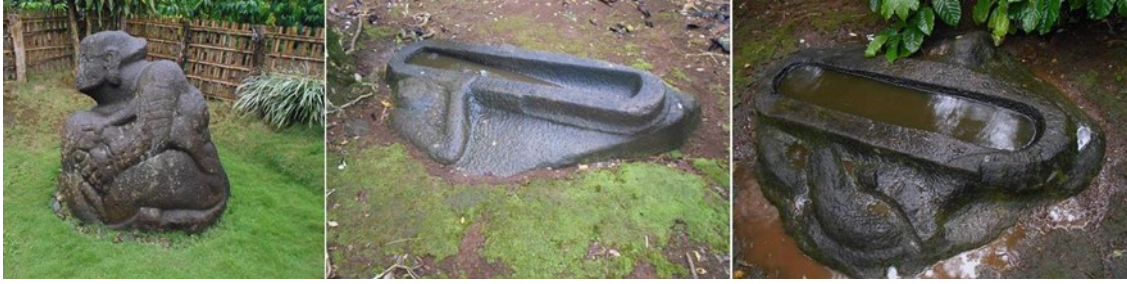
Figure 4: Megalithic sites in Pulau Panggung village, Pajar Bulan sub-district.

Megalithic sites in the village of Gunung Megang (picture 3) are located in several locations in the middle of the community coffee plantations. This site location is about 1km to 1.5 km from local community settlements.