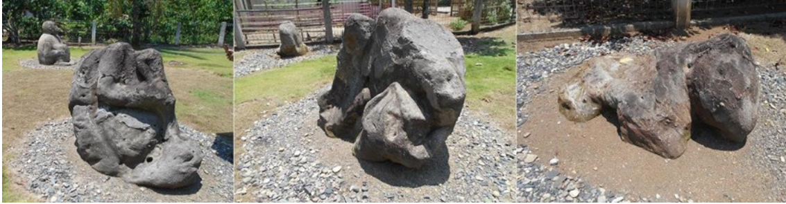
Figure 6. Megalithic site in Sinjar Bulan village, Gumay Ulu district