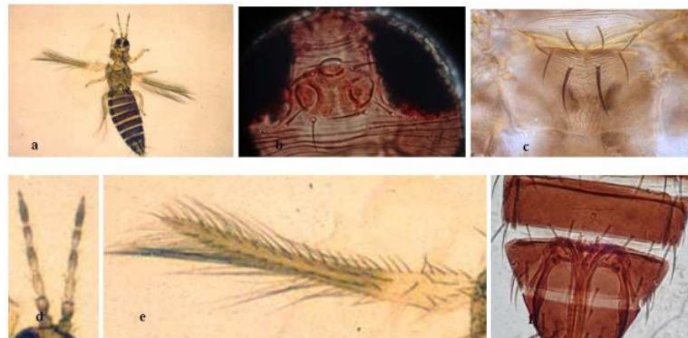
Figure 1. Morphology of T. parvispinus a. female imago, b. Ocellar, c. metanotum, d. antenna, e. wings, f. tergit VIII