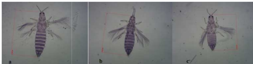
Figure 2. Body size variation of long T. parvispinus (1.42 mm) (a), medium (1.32 mm) (b) and short (1.17 mm) (c) at mulberry 4x

mm. In the highlands of T. parvispinus body size length of 1.46 \pm 0.035 mm, medium was 1.35 \pm 0.051 mm and short of 1.22 \pm 0.089 mm (Table 2). Differences in body length of T. parvispinus long category, medium and short were statistically significantly different.