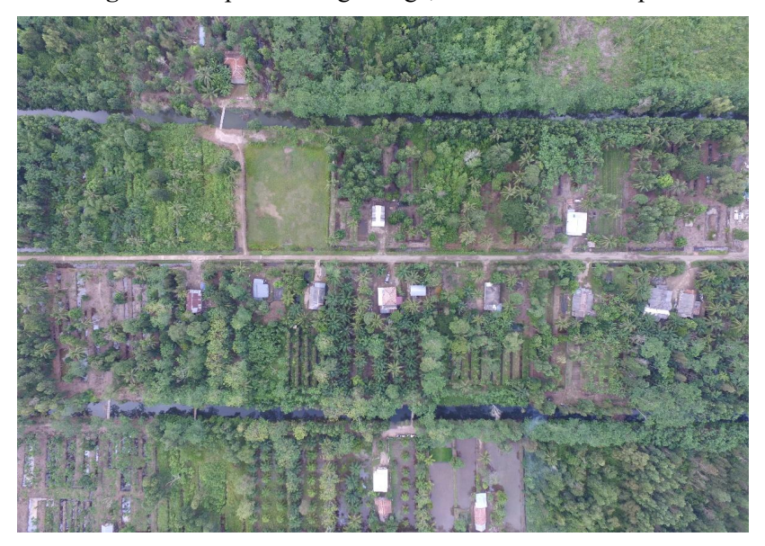
Figure 2. Map of Muara Sugih village, Tanjung Lago sub-district.