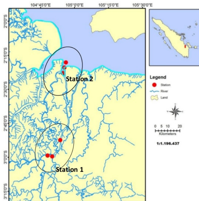
Figure 1. Location of Research Stations

The target fishes in this study were the common fishes caught and consumed by the local people. The fish species that represented Station 1 was Seluang ( Rasbora sp.) whereas the species represented the estuary area was Belanak ( Mugil chepalus ). The fish samples were obtained from local fishermen and identified for its species and kept in a coolbox. In the laboratory, the samples of biota organs were placed in the evaporator dish and heated in the oven at the temperature of 105°C for 12 hours. After cooling, those samples were crushed to be homogeneous. 4 gram biota organ sample was digested in a beaker glass with 10 ml concentrated HNO 3 on a hotplate at a temperature of 85°C for 8 hours. Before the digestion process ended, 3 ml H 2 O 2 was added to the biota tissue sample. The liquid phase was transferred into the volumetric flask and the volume was matched up to 20 ml by adding the deionized distilled water and allowed to stand overnight for then analyzed with