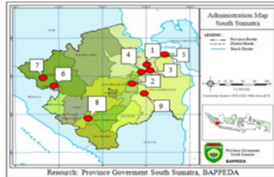
Figure 1. Map of Districts or Cities of South Sumatra. Information : 1. Teluk Tenggara Village, Subdistrict Air Kumbang, Banyuasin District; 2. Pelabuhan Dalam Village, Pemulatan Subdistrict, Ogan Ilir District; 3. Perambahan Village, Banyuasin 1 Subdistrict, Banyuasin District; 4. Mariana Village, Banyuasin 1 Subdistrict, Banyuasin District; 5. Karang Anyar Village, Muara Padang Subdistrict, Banyuasin District; 6. Simpang (SP) 3 Temuan Sari, RT 1 Muara Kelangi; 7. Tanjung Agung Kampung V Village, Karang Jaya Subdistrict, Musi Rawas District; 8. Palang Ujung Village, Kelurahan Tanjung 3, Semendo Darat Ulu Subdistrict, Muara Enim District; dan 9. Terusan Menang Village, Sirah Pulau Padang Subdistrict, Ogan Komering Ilir District.

Exploration and inventaritation of local varieties of rice South Sumatera has been done using Purposive Sampling Method in some district or cities in South Sumatra. The location has been choosen according to literature study and interview. The location of local varieties of rice South Sumatra showed in (Figure 1).