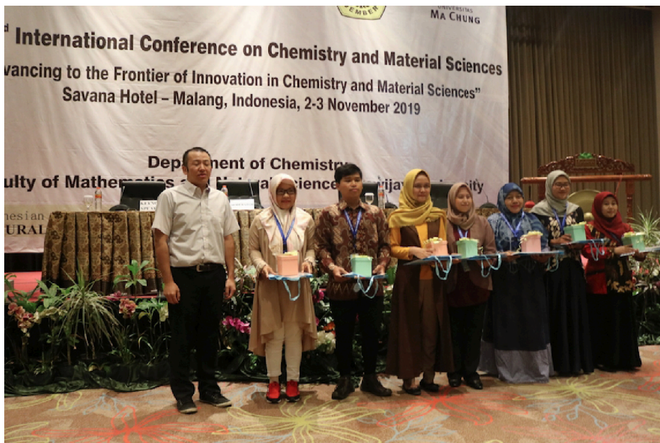
Picture 3. Poster session and poster award winners.