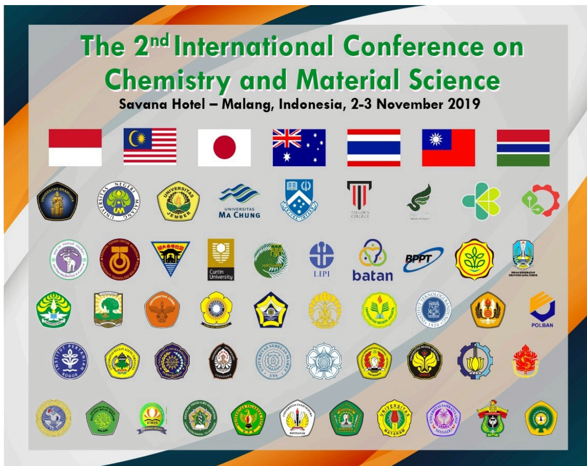
Picture 1. Flags of the participants' country and logos of the participants' institution.