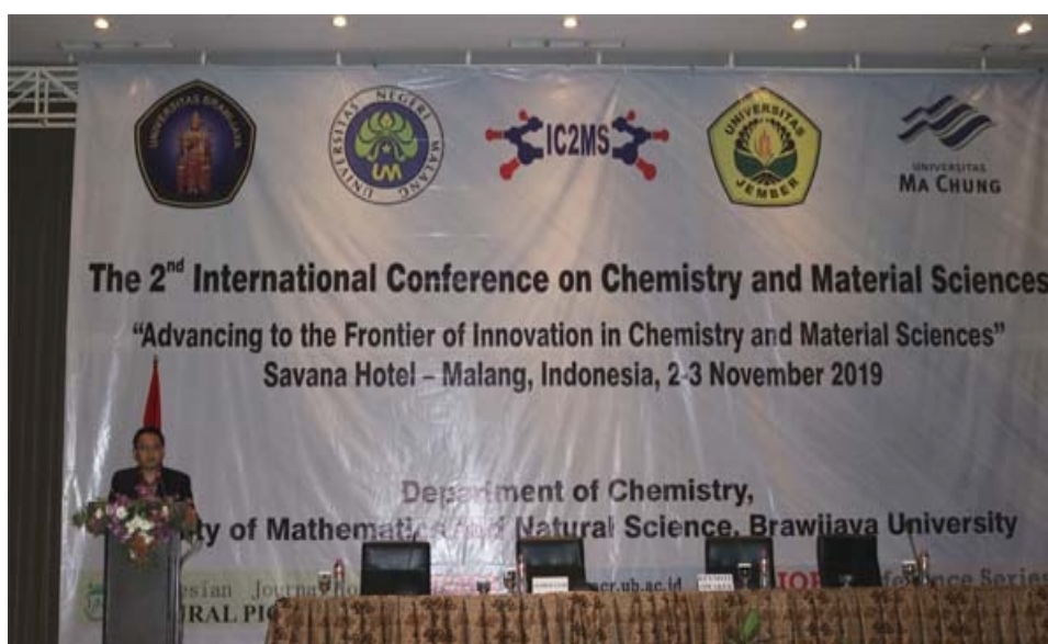
Picture 2. Opening remarks by the chairman of the 2 nd IC2MS