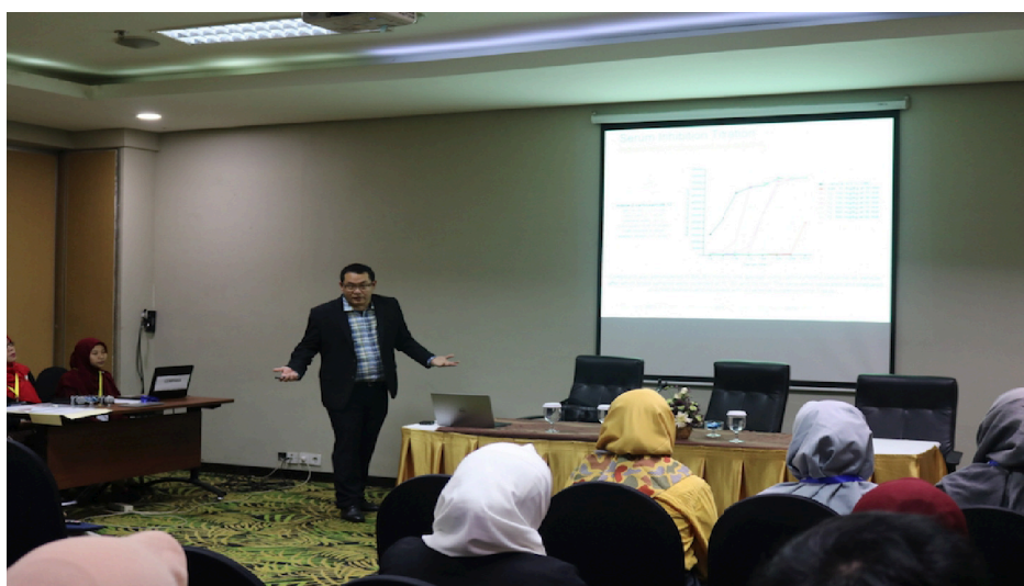
Picture 4. One of the invited speaker's talk.