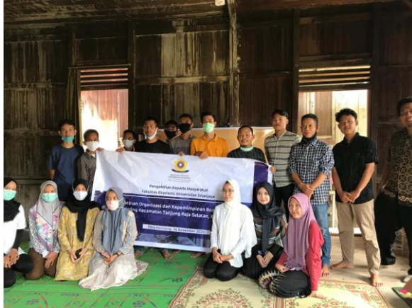
Figure 2. Participants of Organizational Training and Leadership

A leader is an optimist, a person who can see a better future. Not everyone can think like this. Especially if the current conditions are very bad. The ability to change the situation for the better is determined from the mindset, what can be done for a better future (Ambarita, 2013). To be a good leader, there are several things that must also be considered: