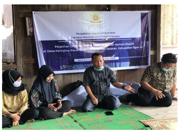
Figure 1. Presentation of Organizational Training and Leadership

Running an organization is not as easy as imagined, because the organization consists of many different people even though they have the same goal, but within the organization, of course there will be conflicts or organizational problems. This problem sometimes even arises in an organization that is already established and has experience. There is no coordination between members of the organization which often causes misunderstandings, which of course can lead to chaos in the implementation of a program. This chaos can occur when the people in charge do not know the limits of their duties. This will cause an imbalance in the implementation of work tasks because when there are members working on tasks, others experience job vacancies. This is certainly undesirable to happen in an organization, even by established ones. There is a process for solving problems in the organization, making decisions, strengthening team cohesiveness and getting appropriate and wise solutions: