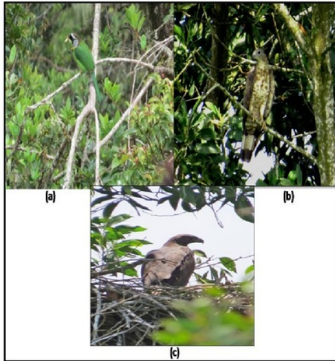
Figure 2. Three birds protected (a) Psilopogon-pyrolophus (b) Pernis ptilorhynchus (c) Nisaetus cirrhatus .

From the above, the existence of the protected forest needs to be maintained as a habitat for threatened species and protected so as not to become extinct in the wild. So that monitoring of wildlife is needed, especially to see the trend of status of threatened species from various illegal activities in the Bukit Jambul Gunung Patah protected forest like illegal hunting, land clearing, illegal logging this data can be used as scientific information for management policies in the region.