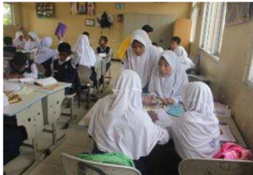
Figure 2. students interested in reading the article given.

The experiment was conducted in three meetings that consist of two meetings for learning activities and one meeting to test the skills of mathematical modeling. The learning in this study using student worksheet made based MEAs components namely newspapers article, readines or warm-up questions, the data table or mathematical information, and statment problem. The learning process in component newspapers article, the article given in the form of problems in daily life, that is about motor vehicle progressive t 6 , it given to each group of students, it seems like the students are interested in reading the article it can be seen in Figure 2 and then the students are required to read and understand the contents of the article.