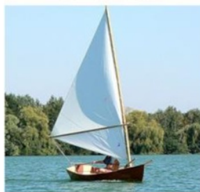
Gambar 1. Perahu Layar