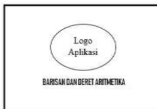
Figure 1. loading view storyboard.

The purpose of making storyboard is to be able to provide a clearer picture of the product design. In making the storyboard, researcher designed the display of teaching materials based on Android that were developed such as the layout between text and images, the layout of the buttons and the rough appearance of the teaching material to be made. The storyboard design results from a number of menus in the teaching materials arithmetic sequence and series based on Android are shown in Figures 1.2 and 3.