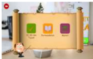
Figure 4. learning menu display.

At this stage, researcher conducted the process of making teaching materials that start from typing the contents that will be loaded in teaching materials, making animations, and designing the background display of teaching materials using the help of software Microsoft Office PowerPoint, Corel Draw, Camtasia, and Wondershare Filmora. After that, continued by inserting images, text, sound, and animation that have been made into the teaching material application where in making this application researcher use the help of Android Studio as an Android application developer software. The display of teaching materials developed by researcher is shown in Figures 4.5 and 6.