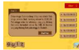
Figure 9. revision of quiz menu display.

Teaching materials that have been revised are shown again to the validator. The validators then agreed to the results of the revision by the researcher by stating that the teaching materials arithmetic sequence and series based on developed by the researcher were categorized as valid and worth testing at the small group stage.