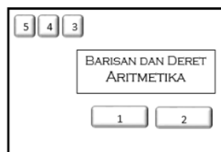
Figure 2. main menu storyboard.