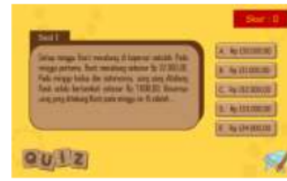
Figure 6. quiz menu display.