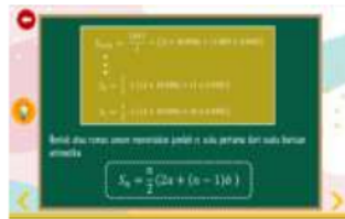
Figure 5. material menu display.