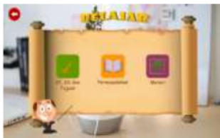
Figure 7. revision of learning menu display.

After the expert review and one-to-one trials on teaching materials are carried out, further improvements are made to the teaching materials based on the comments and suggestions given by the validator and students. Some of the results of improvements in teaching materials are shown in Figures 7.8, and 9.