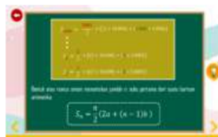
Figure 8. revision of material menu display.