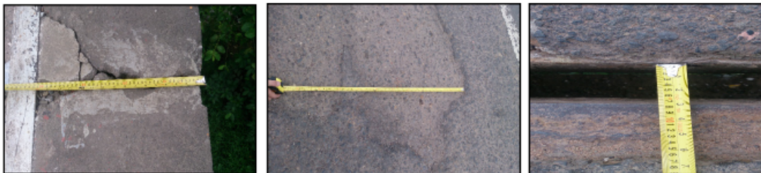
Fig. 2. Damage measurement on truss bridge.

The condition assessment on the upper structure of 9 truss bridges was conducted. However, only three bridges are explained in this paper. The damage cases were assessed on each element to identify the types and volume of the damages as shown in Table 3. The list of damages was described regarding the kind of damage, level, and magnitude of damages in every element of the upper structure of 9 truss bridges. The upper elements consist of the truss, running surface, deck joint, bearing, and railing. It was found that there were approximately 900 m' of components damaged at the railing of Baruga Bridge and 227 m' truss damages due to the decrease in the quality of the galvanized paint. Similarly, Air Kelingi Bridge had around 800 m 2 of cracks on the surface layer of the running surface. Meanwhile, Air Batu bridge had the least damages for all parts of the upper structure of the bridge elements.