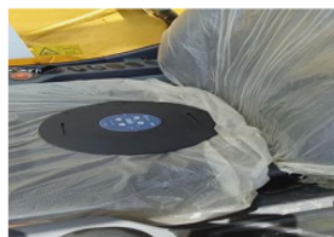
Figure 2 Accelerometer tool

NBM score = -5.196 + 82.208 WBV + 1.343 Age + 0.043 Cigarettes - 0.123 Working period