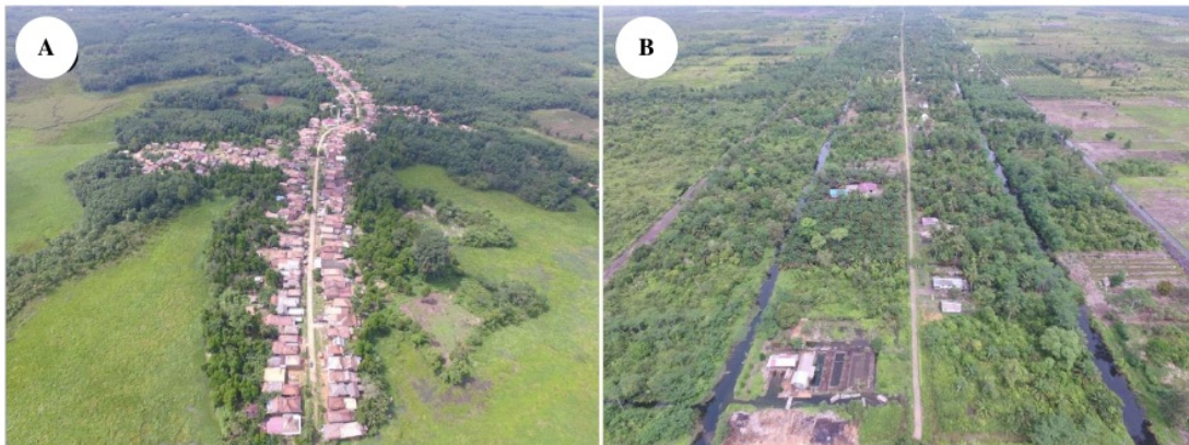
Figure 2. Landscape of (A) Sedang Village, and (B) Muara Sugih Village, Banyuasin District, South Sumatra, Indonesia