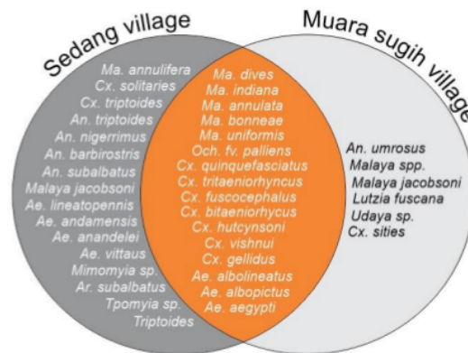
Figure 3. Species composition of mosquitoes at study areas of two villages in Banyuasin District, South Sumatra, Indonesia

Interestingly, there is an opposite pattern of dominant genus between two study areas in which a dominant genus in a village has a low number and percentage in the other village and vice versa. For example, there were 3.14% of Mansonia detected in Muara Sugih, while Culex comprised 3.09% of total mosquitoes in Sedang Village. Other species have medium level of occurrence in both studied areas such as Aedes , but it has higher number collected in Muara Sugih Village than in Sedang Village. The rest genera relatively have similar numbers for both studied-areas. The findings of the diversity from two different studied areas provide baseline information on the distribution of mosquitoes in Banyuasin District.