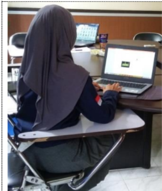
Figure 2. The one-to-one photographs