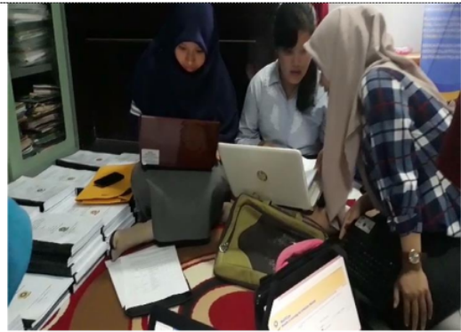
Figure 3. Small group photographs

Figure 2 and 3 show how students use e-learning in one to one phase and small group phase. In this phase, it is seen whether students are able to operate the e-learning or not. It is also figured out whether students experience difficulties in using e-learning or not. The result is that students had no difficulties in operating and using e-learning content developed.