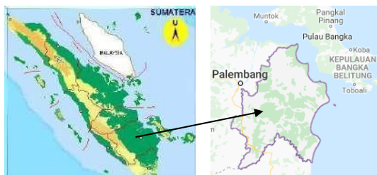
Figure 1. Demarcation of OKI District, South Sumatra Province, Indonesia

This research has been carried out in swamp forests of Ogan Komering Ilir (OKI) District, South Sumatra. Demarcation of OKI District, South Sumatra Province, Indonesia is given in Figure 1. This research was characterized as an experimental research by using factorial design in complete randomized design (CRD factorial design) with two treatment factors. The first factor is farmer's tribe and the second factor is time (year). The first factor consists of two tribes (namely local communities and the newcomers), while the second factor consists of four year levels, namely 1970; 2000; 2017; and 2050. Techniques of collecting data were using questionnaires and the number of respondents was expressed as replication, then conducted by intensive study of various literature and in-depth interviews to key informants related research focus. Data analysis was performed by using variance analyses and tested with post hoc test using Tukey test. The research scope is focused on the aspects, such as the experiences of rural communities living around the area, the utilization of forest resources by rural communities, the rehabilitation and conservation of lands, and the revitalization of forest and land resources.