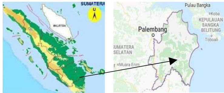
Figure 1. Demarcation of OKI District, South Sumatra Province, Indonesia