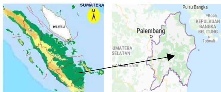
Figure 1. Demarcation of OKI District, South Sumatra Province, Indonesia

This research has been carried out in swamp forests of Ogan Komering Ilir (OKI) District, South Sumatra. Demarcation of OKI District, South Sumatra Province, Indonesia is given in Figure 1. The data were collected by direct field observation, intensive study of archive report documents as well as in-depth interviews with the respondents. The process of collecting data was made through participatory approach where researchers took place in daily life of farmers. Techniques of collecting data were using questionnaires and the number of respondents was 377 households of farmers. In-depth interviews to key informants were carried out with key informants, mostly from community leaders consisting of sub-district heads, village heads, neighborhood heads, village leaders as well as the chairmen of NGO (Non-Governmental Organizations). The intensive study of archive report documents came from Government and private institutions, such as the Regional Development Planning Board or NGO as well as University. Collected data were concluded, presented and then analyzed statistically. The research scope is focused on the aspects, such as the experiences of rural communities living around the area, the utilization of forest resources by rural communities, the rehabilitation and conservation of lands, and the revitalization of forest and land resources.