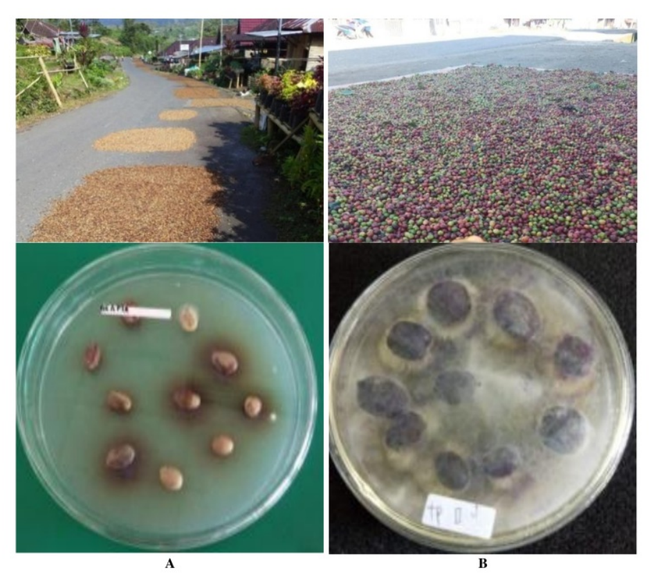
Figure 1. A. Coffee beans dried on asphalt road and tested on PDA. B. Coffee beans dried on tarpaulin and tested on PDA