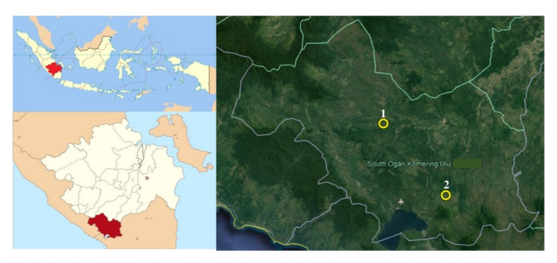
Figure 1. Location of the research in South Ogan Komering Ulu District, South Sumatra Province, Indonesia, i.e., 1. Buay Sandang Aji (4°32'24.3"S,103°52'46.6"E), 2. BPR Ranau Tengah (4°46'02.8"S,104°04'36.8"W)

The analysis was performed by using direct plating methods as described by Samson et al. (2004). Coffee beans from each sample were disinfected with 1% sodium hypochlorite for one minute and rinsed with sterile distilled water for 1 minute, with 2 replications. They were then dried in a Petri dish covered with 2 sheets of sterile filter paper. Then, a total of 10 beans were placed in a Petri dish (9 cm in diameter) containing a PDA medium with 0.01% chloramphenicol. The beans were inoculated when the medium was frozen and then incubated at 28°C temperature until there was fungal growth on the medium (4-5 days). The beans were observed macroscopically by paying attention to the characteristics of each fungus. Furthermore, the fungal isolates were grown on MEA (Malt Extract Agar) medium and observed microscopically. Identification was carried out by using key fungal identification tables or matching the descriptions by Houbraken et al. (2012), Gautam and Bhadaurai (2012) and Samson et al. (2014).