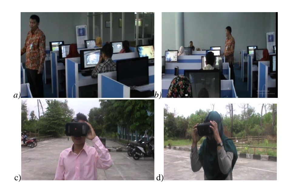
Fig. 2 (a) and (b) Students operate Virtual museum by using PC, and (c) and (d) Students use 3D Virtual goggles to access the virtual museum