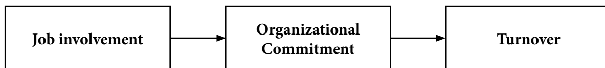
Figure 1. Research framework

Research Framework is presented below (Figure 1).