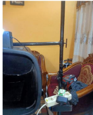
Picture 5. Connect to stream electricity