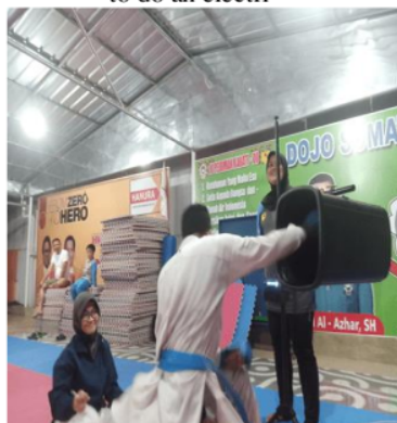
Picture 8. Athlete's Position When Hitting