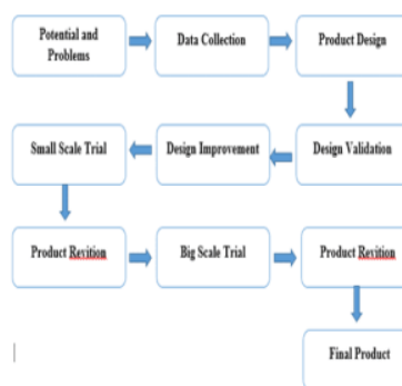
Picture 1. Research Procedure

This research uses research and development methods or better known as Research and Development (R and D). This research method is used to produce certain products and test the effectiveness of these products. The steps for using the Research and Development Method (R & D). The steps are as follows: