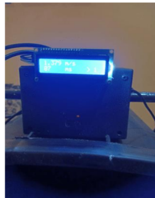
Picture 6. After being connected to current, the tool will appear to do a punch countdown number after 1 tester can hit