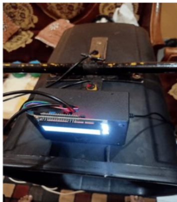
Picture 4. Mount the Tool on the Stand

The form and steps for the operation of the punch speed measuring instrument in more detail can be seen in the image below: