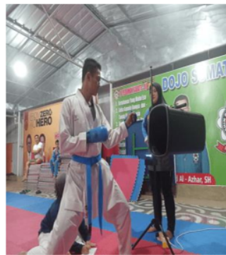
Picture 7. Athletes are getting ready