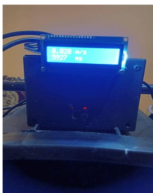
Picture 9. LCD display of results punch speed