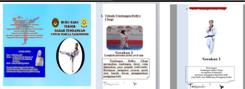
Figure 1. Pocket Book Cover and Taekwondo Kick Technique Movement

Initial observations were made with initial test tests that showed a significant difference in average results between the initial and final tests. The average initial test measurement result was 46.67 and the final test was scored at 82.33, resulting in an average difference of 35.66.