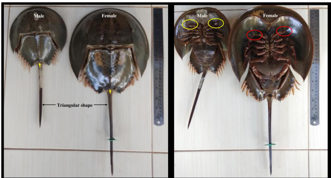
Figure 1. Tachypleus gigas from Banyuasin Estuarine Waters, South Sumatra, Indonesia. This species has a triangular telson shape and only one spine (yellow arrow) on the rear part of the opisthosoma. Female has a chelate clasper like scissors (red oval) while the male has a hemichelate clasper like hooks on the first and second walking legs (yellow oval).