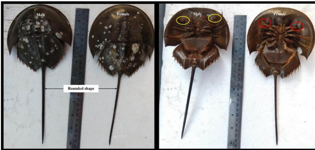
Figure 2. Carcinoscorpis rotundicauda from Banyuasin Estuarine Waters, South Sumatra, Indonesia. This species is smaller than the others and the only species where the telson cross-section is rounded. Female has a chelate clasper like scissors (red oval) while the male has a hemichelate clasper like hooks on the first and second walking legs (yellow oval).