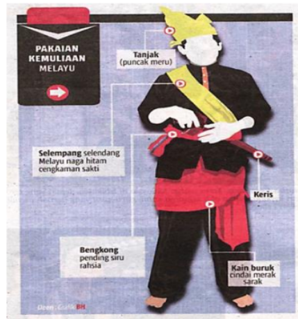
Figure 1. The use of Malay traditional clothes and tanjak 1

Malay traditional clothing is a manifestation of the Malay culture itself, where the shape, structure, function, ornamentation, and manufacturing method have certainly existed from past time and passed down from one generation to the next, serving as a form of preserving the culture. One of the main components of Malay culture is Malay traditional clothing. This traditional Malay dress was formed and explicitly designed by the Malay community by prioritizing creativity and aesthetics as well as the meaning contained therein (Handoko, 2017). Likewise, it is true with tanjak itself, which was created as a manifestation of the high value of dress in the Malay tradition.