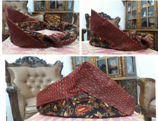
Figure 3. The typical tanjak of Palembang 3