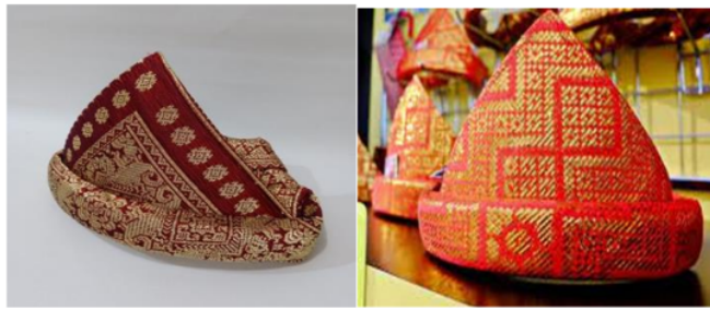
Figure 4. Songket Tanjak 4