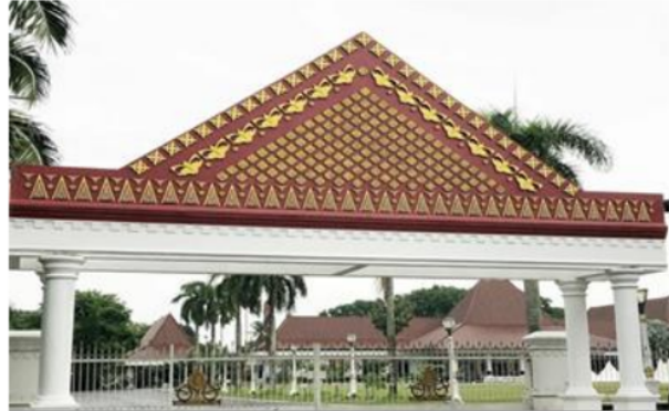
Figure 5. Tanjak ornaments at Griya Agung 5

After the Sumatra Selatan provincial government ratified this governor regulation, several offices and tourist attractions started to build their tanjak ornaments. So far, from the observations of this study, several offices and tourist attractions that have used tanjak as office ornaments are as follows: