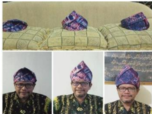
Figure 2. Types of tanjak in Palembang 2

The types of Palembang tanjak consist of tanjakkepundang , tanjakmeler , tanjakbelanumbang , and ikat-ikat ketangbekarem . There are many types of tanjak , the only difference being the type of material used. Along with the development along many eras, there have been many types of tanjak circulating in the people of Sumatra Selatan. According to Mr. Ali Hanafiah, this is not a problem as long as the philosophy of tanjak remains in strongly held.