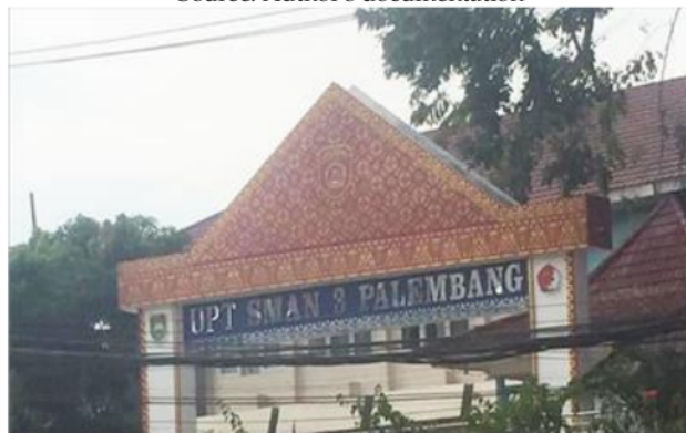
Figure 9. Tanjak ornaments at SMA Negeri 3 Palembang 9