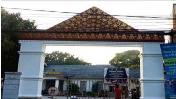
Figure 8. Tanjak ornaments at SMK Negeri 3 Palembang 8