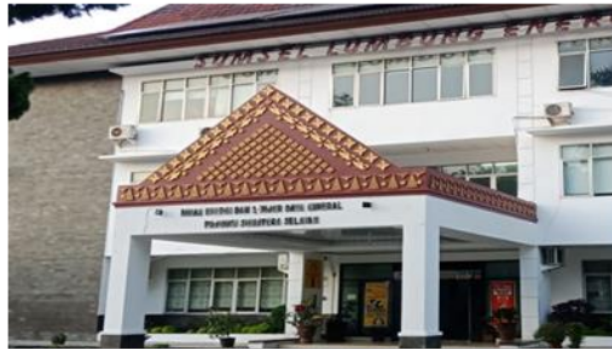
Figure 6. Tanjak ornaments at the Department of Energy and Mineral Resources of Sumatra Selatan 6