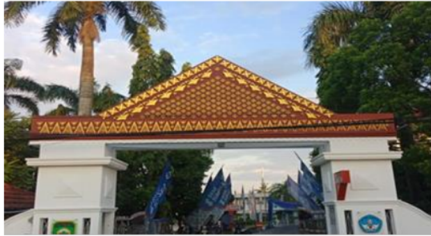
Figure 7. Tanjak ornaments at SMA Negeri 1 Palembang 7