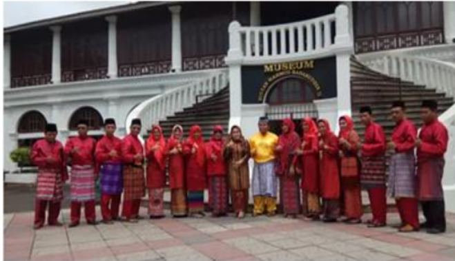
Figure 11. PNS of Palembang's Department of Culture and tourism wearing traditional Palembang clothes