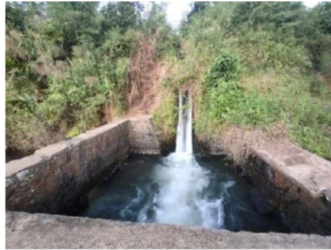
Figure 3. The Water Sources In Pagaruyung Village Lahat Regency.

At the research location, the springs generally come from rainwater that is stored naturally in protected forests in the highlands of Bukit Barisan and Mount Dempo. When it rains, the roots of trees in the forest absorb the water that falls to the ground. This water is stored as a reserve in plant roots and flows through the gaps in the soil pores, following gravity, into the topography of the forest.