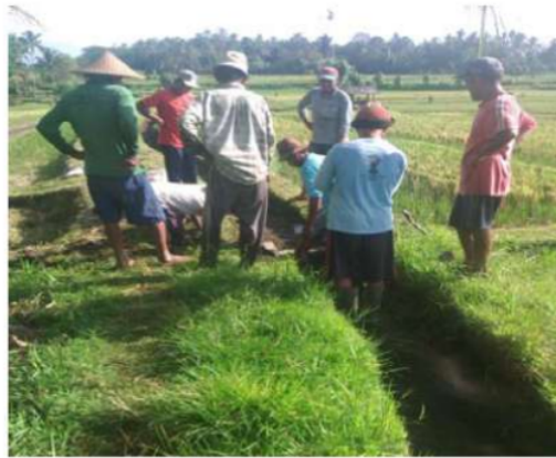
Figure 4. Ngului Ayek are Activities by Farmers

Ngului ayek is one of the efforts in the operational maintenance of irrigation networks. Efforts to control and monitor irrigation networks are especially to maintain smooth flow of water in irrigation canals. Ngului ayek is generally carried out directly by farmers independently or in groups. Before the planting season comes, farmers usually take advantage of this momentum to carry out mutual cooperation to clean irrigation canals together. However, outside the planting season, there are farmers who carry out " ngului ayek " independently around their own fields. After the works are done and water channel clean then the water flow will enter the rice field smoothly.