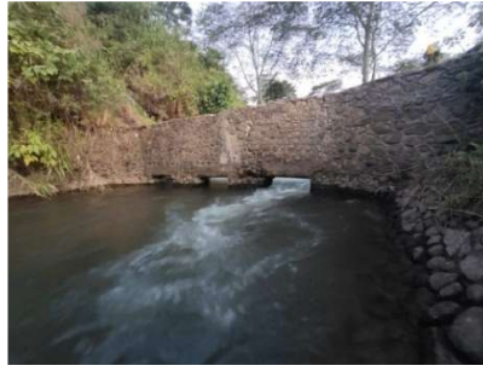
Figure 2. A Dam in Pagaruyung Village, Lahat Regency.

are slightly different from other locations. The following is a documentation of a dam or slab found at one of the research sites.