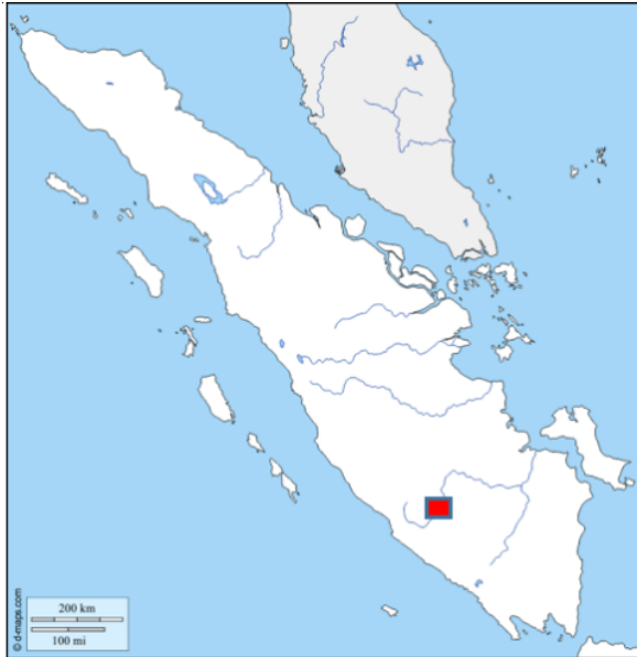
Fig. 1. Location of the Gegas Dam, Musi Rawas, South Sumatra

The field study was carried out in March 2020 at the Gegas Dam, Musi Rawas, South Sumatra, with coordinates 3°14'57.9"S 103°08'10.2" E (Figure 1). Fish sample were collected through fishing efforts using fish bait, cast net, gill nets, hexagonal fish trap and also help from the local Fisherman. Sampling is done at the selected point by purposive sampling based on potential spots of fish. Captured fish were identified refers to Kottelat et al. (1993); Iqbal (2011); Iqbal et al. (2018) and Sukmono and Margaretha (2017).