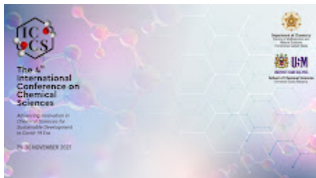
New Virtual Background ICCS 21.jpeg 123K